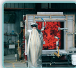
Bush fire testing

AS1530.4-2005: Australian Standards bush fire tested SCREENGUARD® screens have undergone testing to ensure quality performance under the duress of fire.